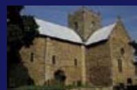
Brant Broughton Church